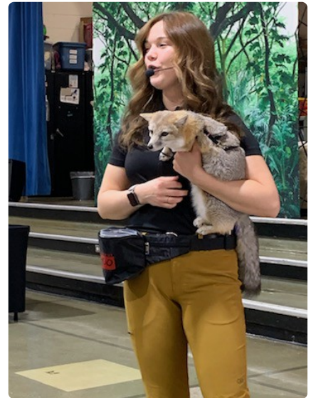
SOPHIE - SWIFT FOX