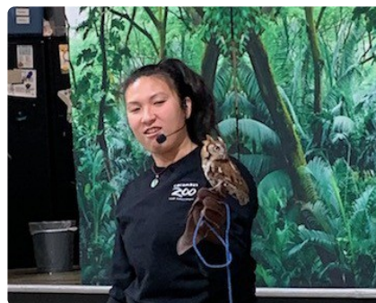
OTIS - SCREECH OWL