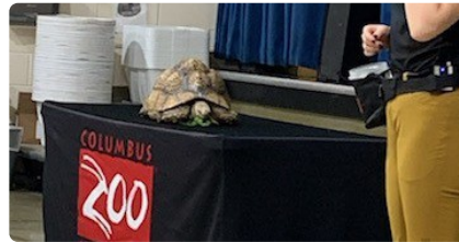
LUCKY - TORTOISE