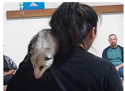
HARVEY - POSSUM