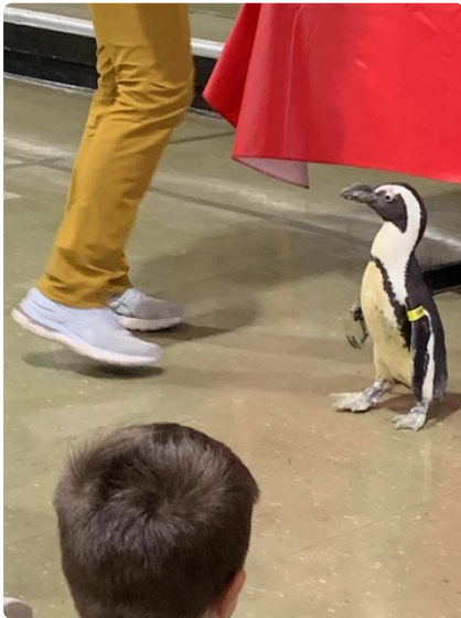
SALMON - AFRICAN PENQUIN